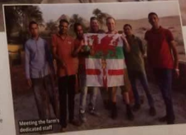
Meeting the farm's dedicated staff