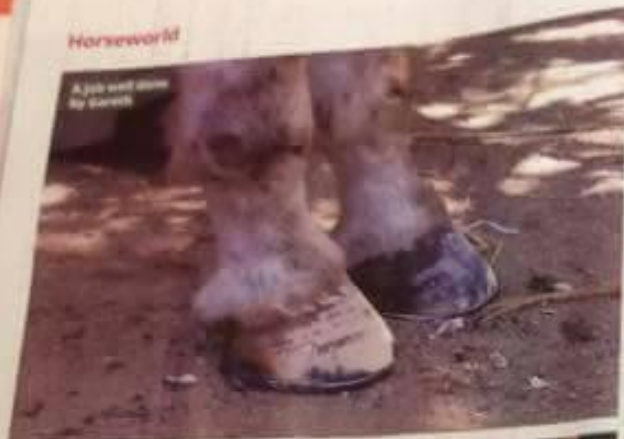
A job well done by Gareth