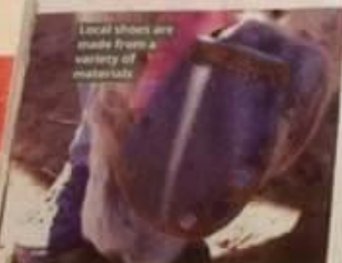
Local shoes are made from a variety of materials