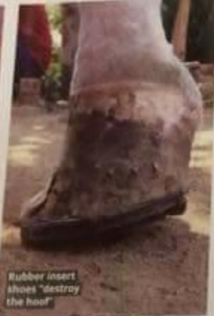
Rubber insert shoes "destroy the hoof"

take out to Egypt, and we were also able to make a cash donation of £500.